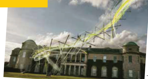
The Met Unframed